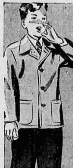
LOAFER JACKETS FOR LITTLE BOYS 4.98

Unusually good looking blankets to keep little darlings snug and warm. Soft, fluffy cotton and wool mixtures, bound in lustrous rayon satin. 36"x50".