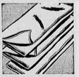
STURDY WATER-PROOF SHEETS 79c

Sizes 7 to 14. Dressy or tailored styles for school and Sunday wear. In fine cottons.