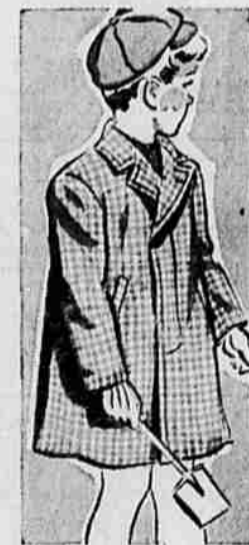
SMART TWEED TOPCOATS FOR LITTLE BOYS 7.98

Sizes 4 to 10. Long wearing blends of wool and rayon. Solid color suede cloth fronts with herringbone or checked backs. Brown, blue shades.