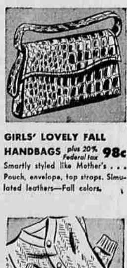
GIRLS' LOVELY FALL HANDBAGS plus 20% Federal tax 98c

And these are! Of durable wool felt with permanently blocked crowns and narrow snap brims!