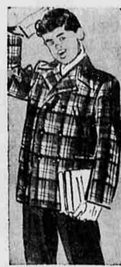
HEAVY MACKINAW WITH WIDE COLLAR 3.98

A boy's best pal when it gets cold! Smooth leather, lined with warm plaid fabric! Zips diagonally to the shoulder... wear collar open or closed.