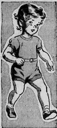
WARDS LONG-WEARING COTTON CREEPERS 1.19

Sizes 7 to 14. They're one of the most practical items in her Fall and Winter wardrobe because she can combine them to make so many different outfits. She'll wear them with suits, jerseys, skirts and jumpers for school or Saturday's shopping. She'll wear them with slacks and shorts for playtime. Boxty slippers in all wool. In gay bright colors, in lovely pastels.