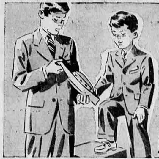
WARDS HANDSOME ALL WOOL SUITS FOR BOYS 12.98

Sizes 4-10. What sets this suit apart from the others as a really outstanding value? Well, for one thing it's the way it looks—and that includes the smart style, the neatly finished seams, the rich blue and brown tweeds. For another, it's the sturdy feel of the rich all wool it's made of. And equally important, are its unseen qualities—expert cutting and tailoring.