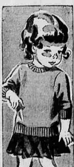
WARM, ATTRACTIVE SWEATERS FOR TOTS 1.98

Smartly styled like Mother's... Pouch, envelope, top straps. Simulated leathers—Fall colors.