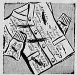
BOYS' WARM COAT SWEATERS 1.98

Neatly knotted permanently... on adjustable band. Stripes, plaids and new bold patterns.