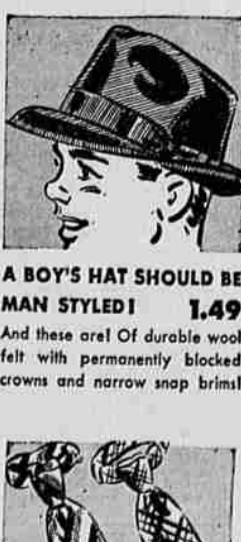
A BOY'S HAT SHOULD BE MAN STYLED! 1.49

Sizes 1 to 4. Darling styles! Beautiful fabrics—all wool top pieces with attractive embroidery trimming. Cotton Kasha lined. Matching leggings.