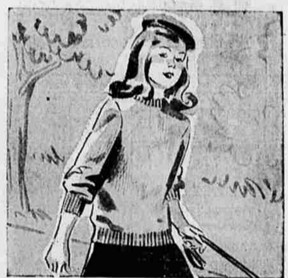
ALL WOOL SWEATERS IN WONDERFUL COLORS 2.98

A boy's favorite winter coat! You needn't worry about his catching cold, either, in one of these warm heavy weights. Bright new plaids!