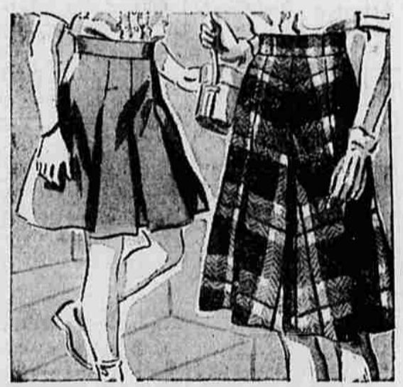
COLORFUL ALL-OCCASION SKIRTS FOR GIRLS 2.98

Sizes 3 to 8. Tailored as sturdily as big brother's. Smart fly-front style of long wearing all wool. Smart tweeds in serviceable blues and browns.