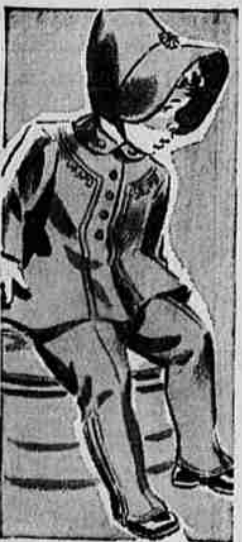
PRETTY LITTLE COAT SETS FOR LITTLE GIRLS 6.98

Sizes 7 to 14. Ask any little girl what article of wearing apparel has the most use and her answer will be—skirts! Yes, she wears them to school with an odd jacket or favorite sweater. She wears them to a special event with a soft, frilly blouse. And of course, she wears Wards skirts because she likes the smart pleated and gored styles in attractive plaids and solids. Wool and rayon.