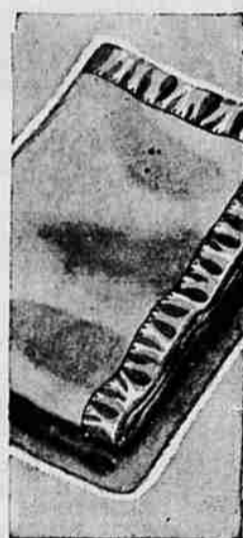
LOVELY CRIB BLANKETS IN PART WOOL 3.98

Fully cut for sleeping comfort... softly napped for warmth! Coat and pull-over styles in fancy striped patterns. Made for long wear. Sizes 8 to 18.