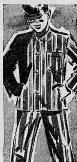
FOR GOOD SLEEPING... COTTON FLANNELS! 1.49

Sizes 4 to 10. Hits with the small fry! Gay sport shirts just like dad's. Well tailored cotton flannel with long sleeves, convertible neck.