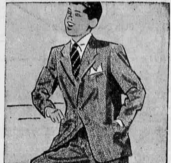
MAN TAILORED SUITS TO FIT INTO A BOY'S LIFE 12.98

Sizes 4-10. What sets this suit apart from the others as a really outstanding value? Well, for one thing it's the way it looks—and that includes the smart style, the neatly finished seams, the rich blue and brown tweeds. For another, it's the sturdy feel of the rich all wool it's made of. And equally important, are its unseen qualities—expert cutting and tailoring.