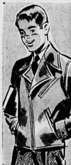
AVIATION STYLE IN LONG-WEARING LEATHER 10.45

A tall order! A boy wants his suit to look like a man's—yet it must be fully cut and comfortable... so it won't hamper his pitching arm! His mother wants an easy-on-the-budget price—yet fabrics she knows will wear! These suits have all those features! In a wide assortment of soft or hard finish fabrics, too. Stripes, solids, plaids, herringbones and diagonals. And a full range of sizes 8-18.