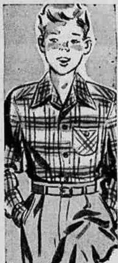
BOYS' SPORT SHIRTS IN CHEERFUL PLAIDS 85c

Sizes 1 to 3. In fine quality cotton that's closely woven for better service! Full cut to keep active little bodies comfortable! Lovely pastels.