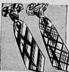
READY-TIED! EASY FOR ANY AGE BOY 29c

Sizes 1 to 3. Pretty pastels—pink, blue and white in good looking, closely knit all wool. Many trimmed with hand embroidery. Slippers, coat styles.