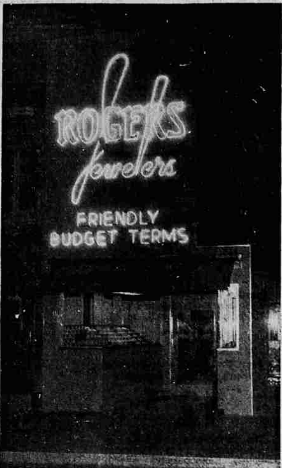
Brilliant light features the new front of the Rogers jewelry store, on Main near Ninth.