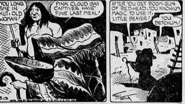
By Leslie Turner