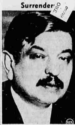
Pierre Laval, above, who flew to Austria to give himself up to United States troops.

Butter Spoilage Probed By Senate WASHINGTON, July 31 (AP)—Senators investigating how service personnel moving across the continent are to be fed veered off today of an inquiry into butter spoilage and learned: 1. Of 3,000,000 pounds of butter stored in Illinois by the war food administration for military use, 3000 pounds has become rancid and would be sold. 2. The navy has had "very little trouble" with spoilage and no butter has been lost. 3. The army's loss by spoilage has been "very small." Acting Chairman Wherry (R-Nebr.) raised the butter issue by asking Dr. D. A. Fitzgerald of the WFA if it were true that large quantities of stored butter had been sold to soap factories.