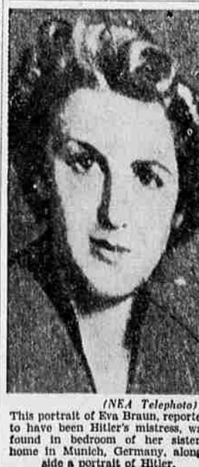
This portrait of Eva Braun, reported to have been Hitler's mistress, was found in bedroom of her sister's home in Munich, Germany, alongside a portrait of Hitler.