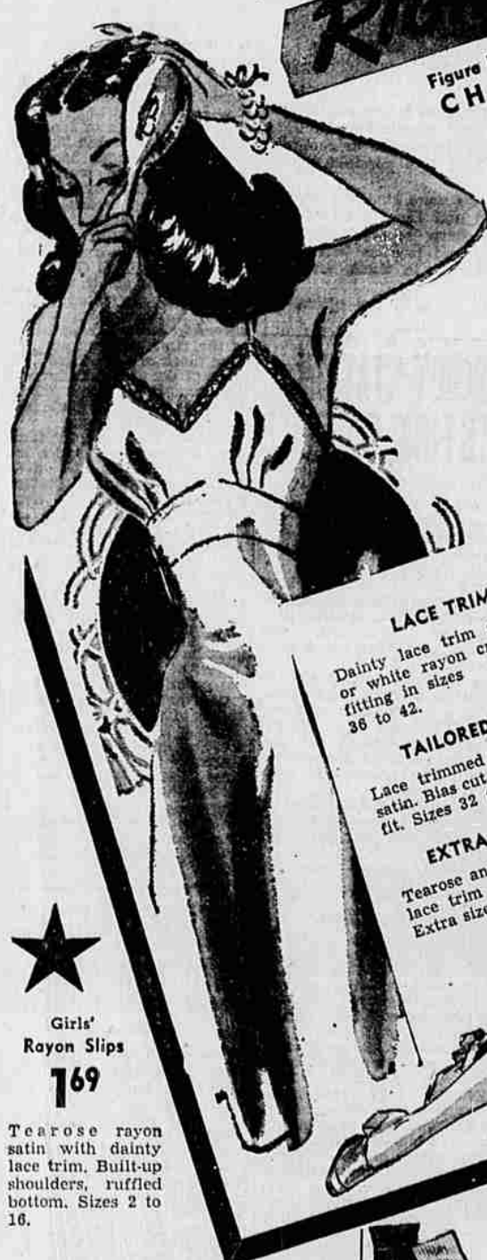
Figure Flattering, Smart CHARMODE SLIPS