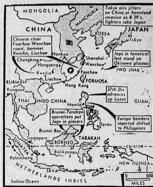
Last stages of the bitter Okinawa battle and Brunei Bay invasion of Borneo by Australian troops highlight Pacific war news of past week. Two offensives are under way in China—the Chinese drives on Kweilin and Liuchow and the coastal campaign.