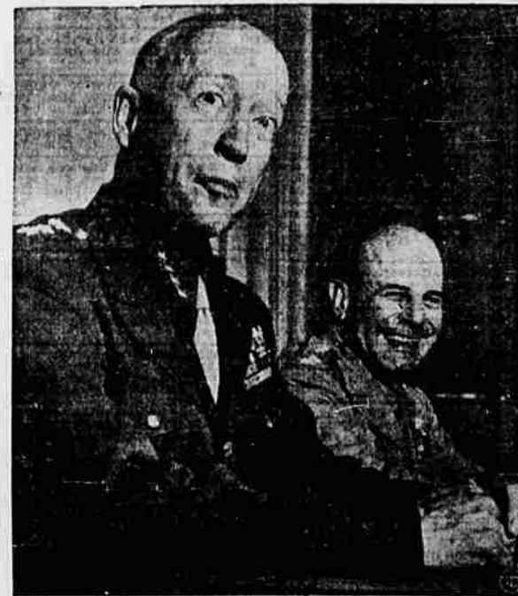
When it comes to pleasing photographers, Gen. George S. Patton, Jr., left, and Lt.-Gen. James H. Doolittle have everything. Here "Old Blood and Guts" mugs for a girl photographer, while General Jimmy produces a big grin as they pose during press conference in Los Angeles.