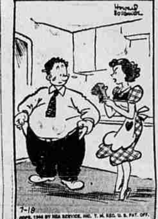
7-18 (AP) BY THE ILLUSTRATOR, INC. U. S. REG. U. S. PAT. OFF.