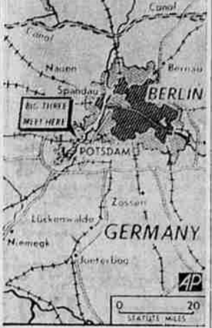
Map locates Potsdam, outside Berlin, where President Truman, Prime Minister Churchill and Generalissimo Stalin will meet. Sessions will begin July 16 or 17..