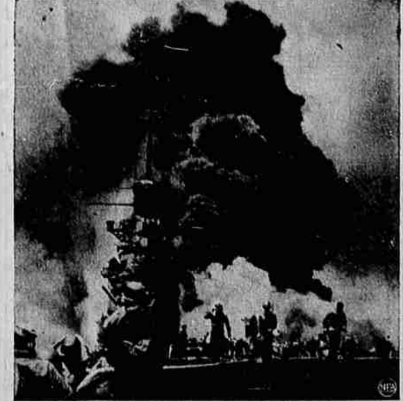
With fire sweeping her flight deck and bomb fragments making an inferno topside, the U. S. carrier Bunker Hill fights back. Smoke is shown billowing from the stern of the ship while crew members hustle to man their battle stations against further attack.