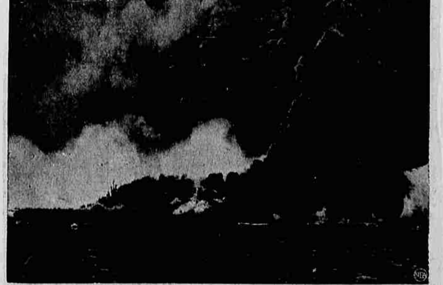
Smoke fills the skies as it rises from the flight deck of the USS Bunker Hill—another gallant ship that refused to die. The carrier was hit twice within 30 seconds by two Jap suicide planes just as she was ready to send off a flight of gasoline-filled and bomb-loaded planes on a mission over Okinawa. Resulting catastrophe cost lives of 373, with 264 wounded. Ship survived to limp into a Puget Sound repair yard where she is being refitted for further duty.