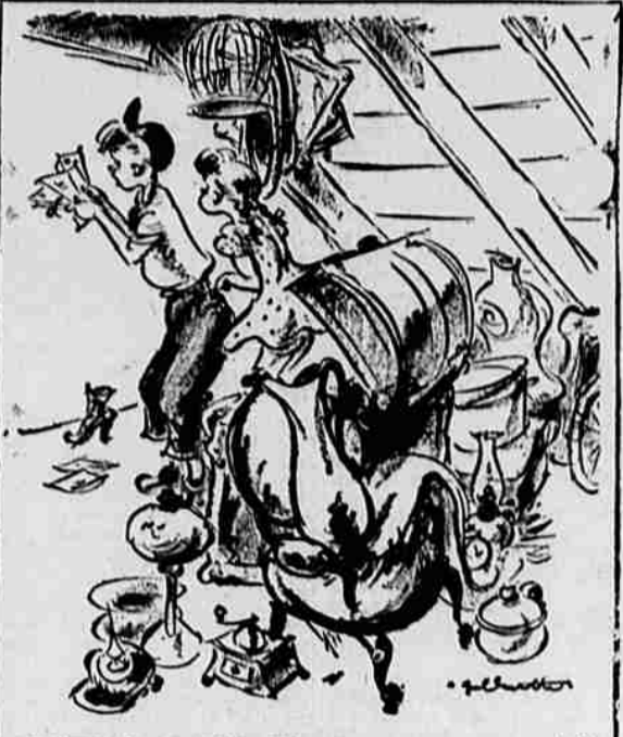
"These old letters sure are hot stuff—when Pop was courting Mom he wasn't making as much money as I am mowing lawns!"