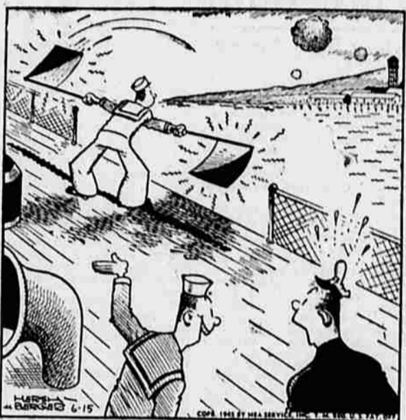
"Perfumed flags—he's sending a love message to his girl friend in the Waves!"