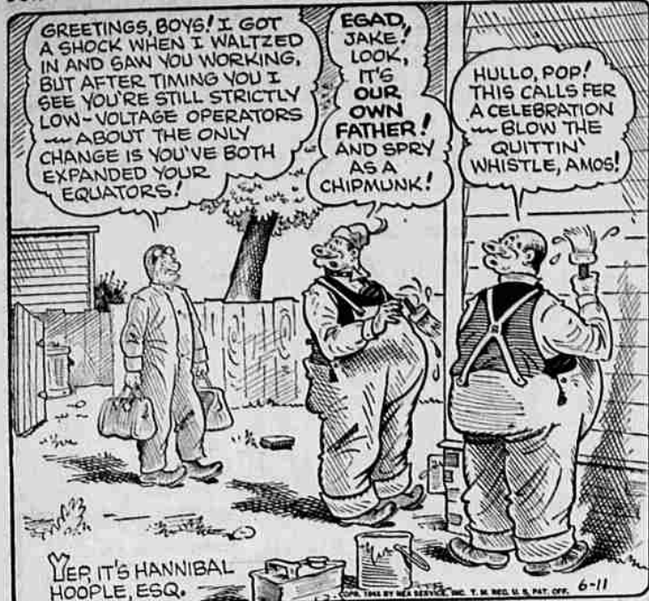
YEP IT'S HANNIBAL HOOPLE, ESQ.