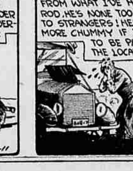
They won't get away this time!