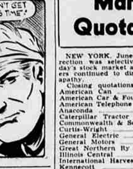
Get a grip on yourself, Doc... Oop was only a prehistoric bum!