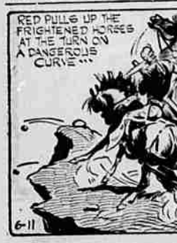
Red pulls up the frightened horses at the turn on a dangerous curve.