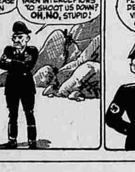
We have it