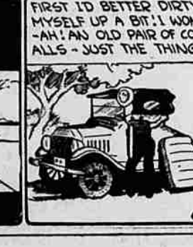
Yes--thanks to you, Red! Bueick's Buick 'Boomer' tried to kill me.