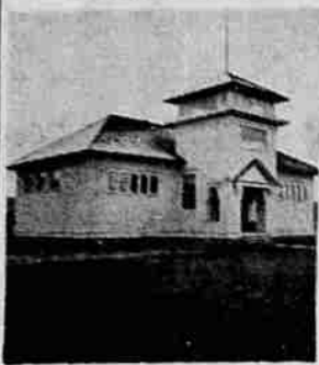
This picture of the old Klamath high school was taken about 1931. The building, which has been vacant for the past decade, is being made over for use as a grange hall.