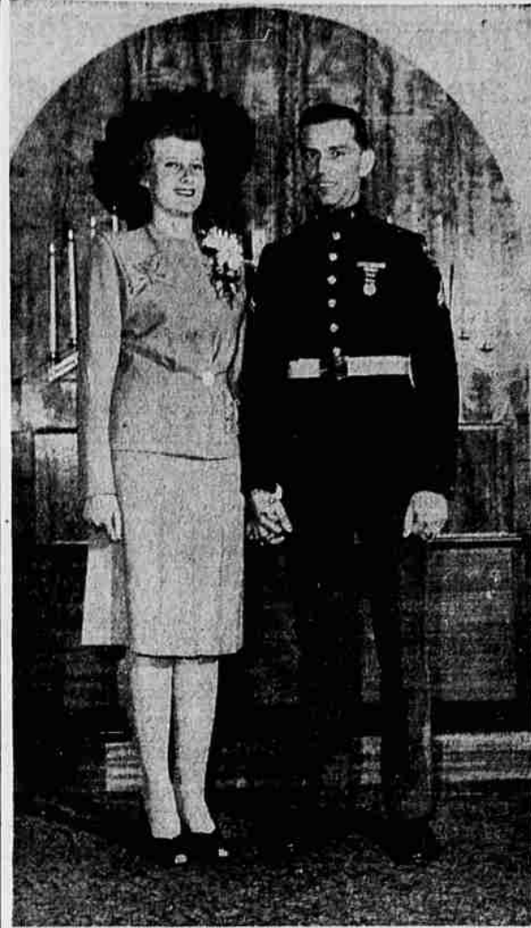
MARRY AT LUTHERAN CHURCH