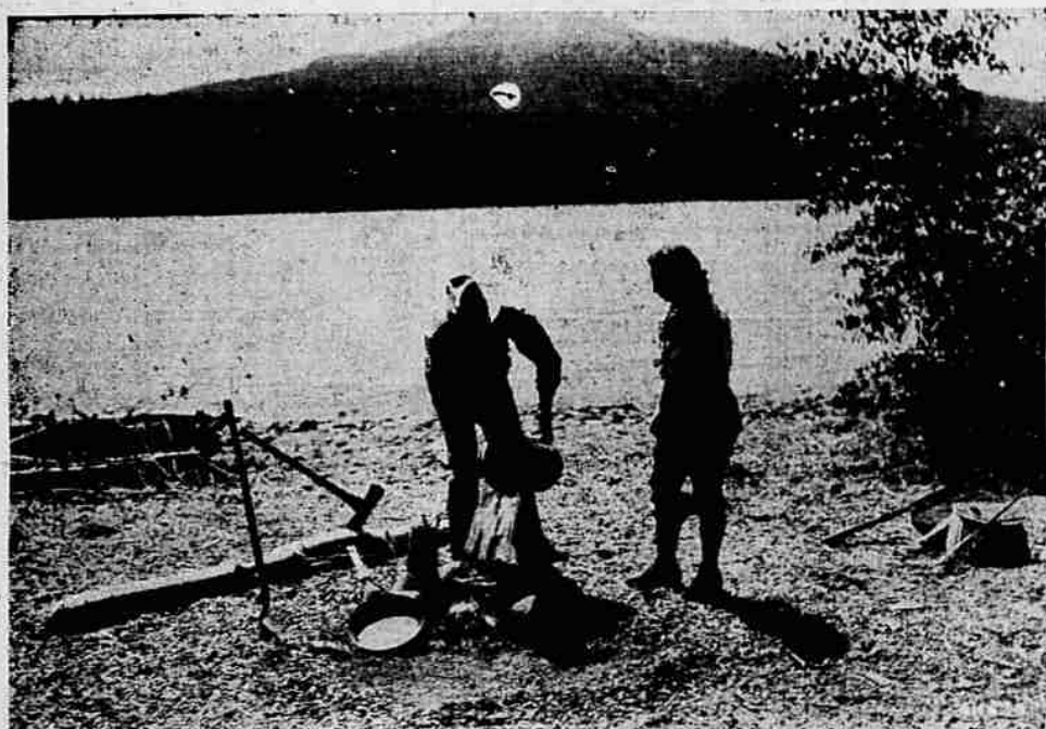
A million man days were spent in Klamath recreational areas in 1940. After the defeat of Japan, if Klamath is kept green we may reasonably expect this figure to jump to 4 or 5 million man days. Experience from the last World War showed that hunting and fishing increased 30% in the first year of peace. To this can be added a many-fold increase in general recreational use by the public not interested in hunting and fishing, who have been confined at home by the demands of war.

But the success of keeping Klamath green will depend on each individual... follow the rules of the forest and continue to enjoy the great outdoors!