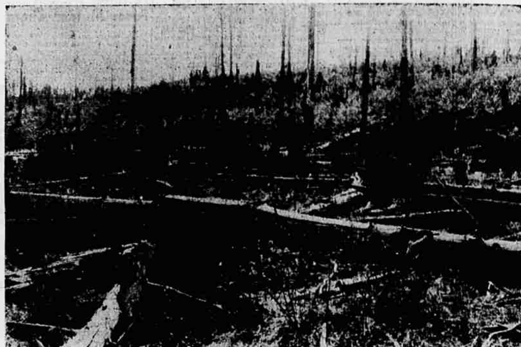
The picture above is a grim reminder of what a moment's carelessness can do to wipe out this heritage for generations. Wider scope for fishing, hunting and general outdoor recreation as a means of easing the nerve strain of war veterans is a recognized need... we can offer this only if we KEEP KLAMATH GREEN! It's up to each individual!