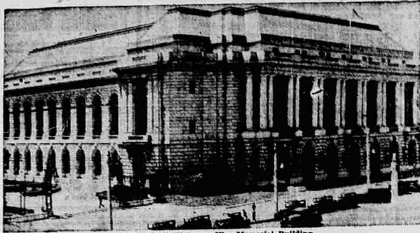
San Francisco's Veterans War Memorial Building