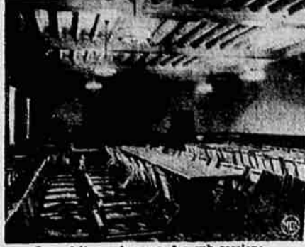
One of its workrooms, for sub-sessions.

Here is the Veterans War Memorial Building at San Francisco, where most business of the United Nations Conference is scheduled. The auditorium seats 1100, can accommodate representatives and aides in plenary session. There are 17 large kitchen-equipped workrooms where problems of two or more nations can be dealt with. Facilities also include many office rooms, a lounge, a reading room. The building dates from 1922.