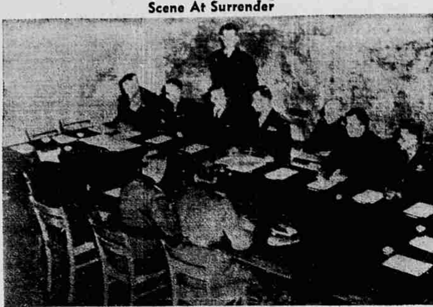
Scene At Surrender