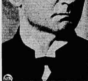
Grand Adm. Karl Doenitz, who will reign over Germany in the blood-red twilight of her world power.