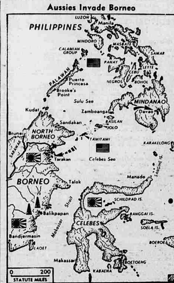
Arrow indicates Australian landings at Tarakan, where beachheads were easily established Tuesday. Troops are now sweeping toward Tarakan's airbase and Lingkas town. In the Philippines, American troops appeared about to capture the port of Davao.