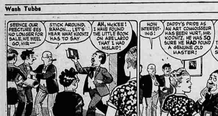
SENCE OUR PICTURE EES NO LONGER FOR SALE, WE WEE GO, MR.