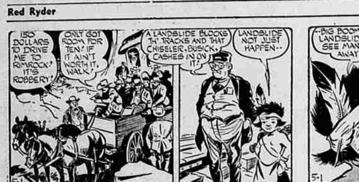
150 DOLLARS TO DRIVE ME TO RIMROCK? IT'S ROBBERY!