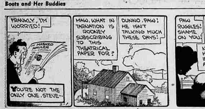
FRANKLY, I'M WORRIED!