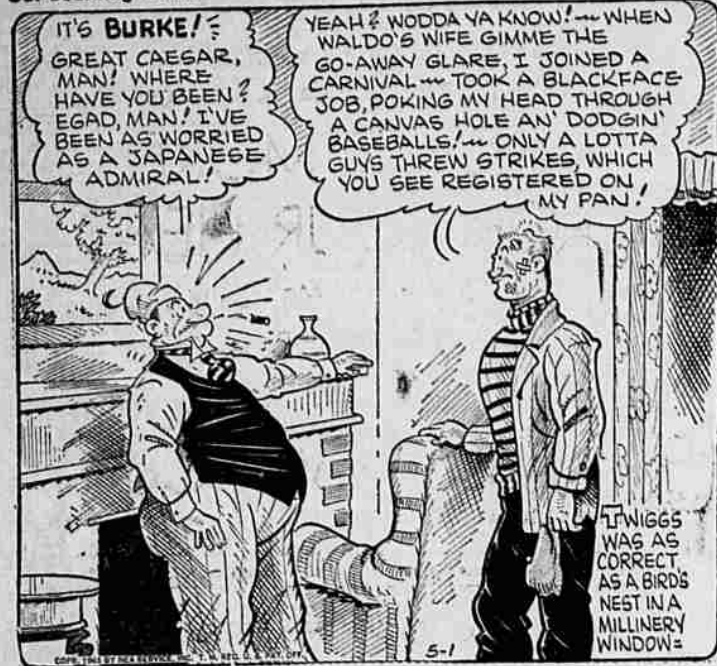
IT'S BURKE! GREAT CAESAR, MAN! WHERE HAVE YOU BEEN? EGAD, MAN! I'VE BEEN AS WORRIED AS A JAPANESE ADMIRAL!