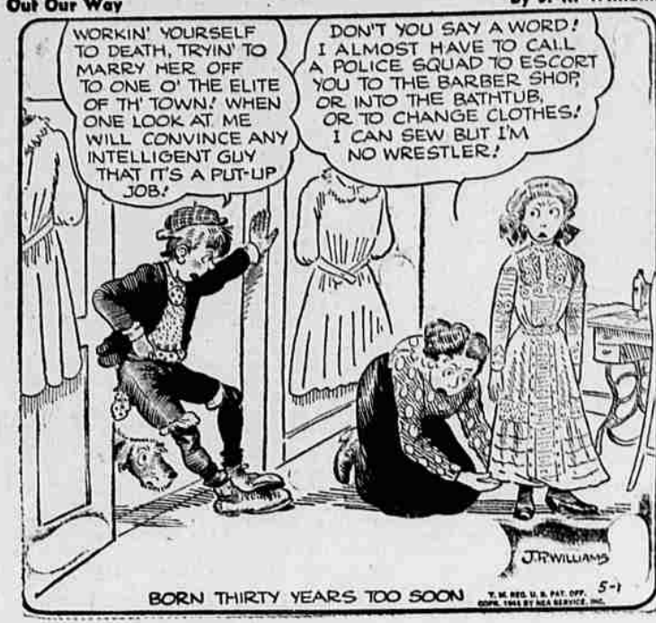
WORKIN' YOURSELF TO DEATH, TRYIN' TO MARRY HER OFF TO ONE O' THE ELITE OF TH' TOWN!