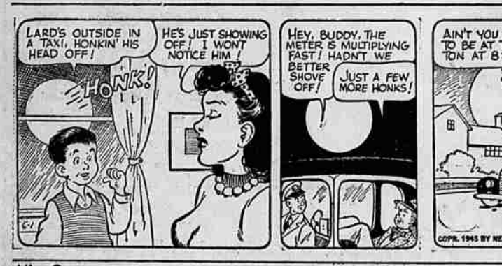
LARD'S OUTSIDE IN A TAXI, HONKIN' HIS HEAD OFF!