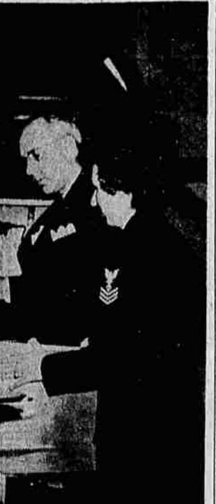
Over the controls of a Link Trainer, Governor Earl Snell today took a ride on a horse. The governor visited the naval training device. The governor visited the naval training device Monday afternoon after inspecting facilities of the barracks.