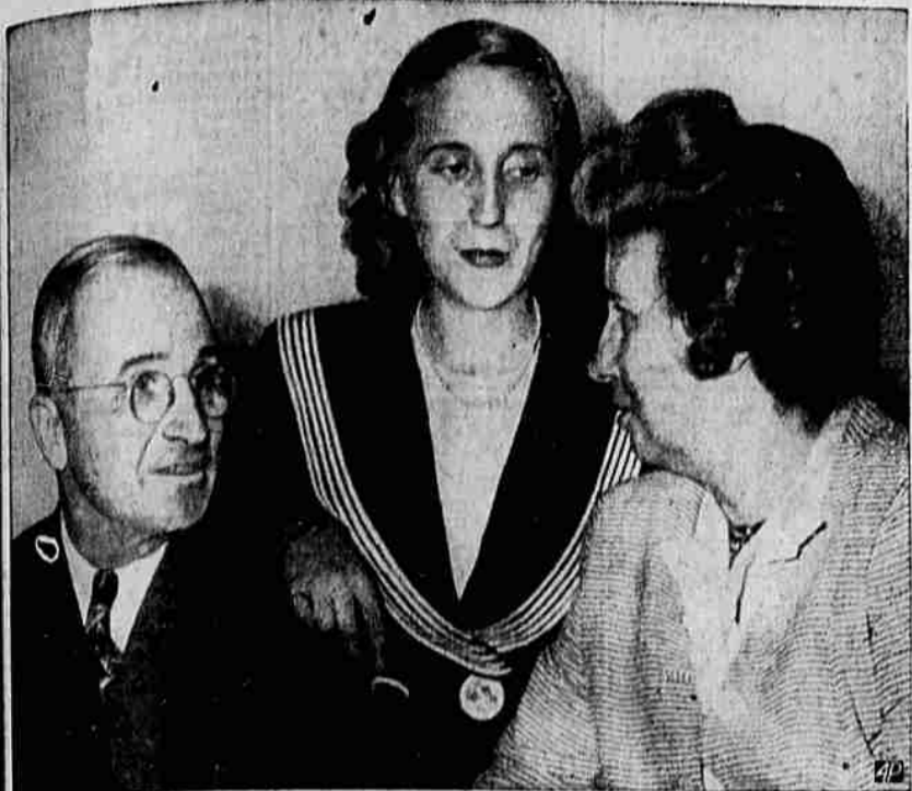
PRESIDENT, HARRY S. TRUMAN, OUR FIRST LADY, MRS. TRUMAN, AND THEIR DAUGHTER, MARY MARGARET