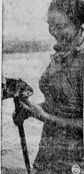
Equipped with goggles and sharp spears, sportsmen and sportswomen go under water in North Carolina for dinner.