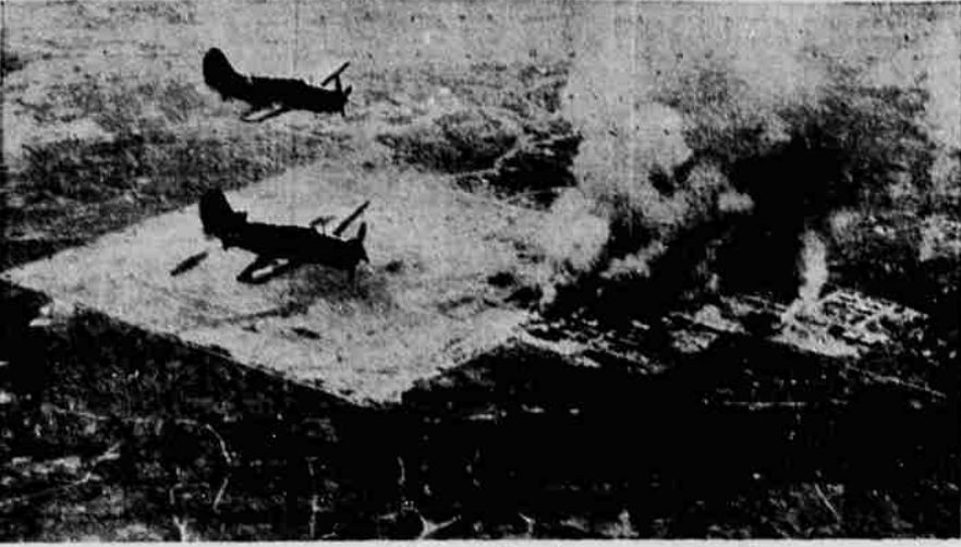
A pair of U. S. navy carrier-based Helldivers wing their way over burning hangers and other air installations at Omura during the navy's devastating strike at Kyushu in the Japanese home islands on March 18.