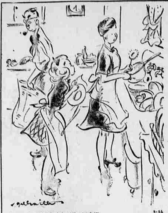
"Twelve years old and I can't go to a boy-girl party! I'm glad they are fighting this war to free the world of tyrants!"