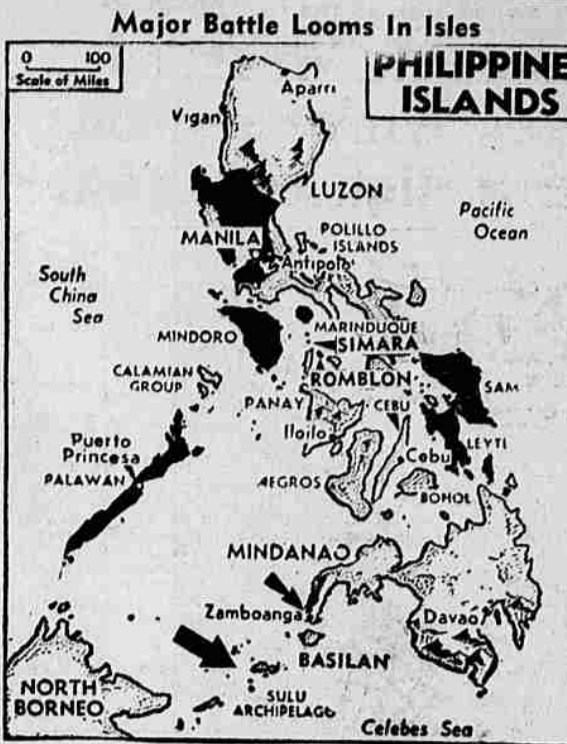
The 33rd division advanced to within artillery range of Baguio today as troops of the 43rd destroyed the entire southern flank of the Shimbu line around Antipolo. Black arrows on the map indicate recent allied invasions of Simara, Romblon and landings at Zamboanga on Mindanao.