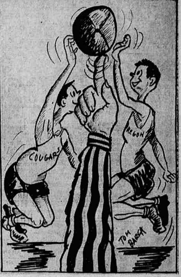
The Webfoots of Oregon clash with the Cougars of Washington State tonight on McArthur court in an effort to nail down first place in the northern division, Pacific Coast conference. The Ducks upset the WSC cagers last Saturday at Pullman and the Cougars will be gunning for revenge and a deadlock in the playoff series when they take the floor tonight.