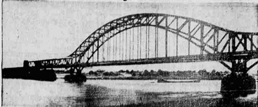
This is the vital Ludendorff railway bridge at Remagen, seized by Yanks in an almost incredible stroke that caught one of Germany's most vulnerable invasion gates completely unguarded. The Americans are now across the Rhine in force and over-running town after town on the east bank against relatively weak opposition.