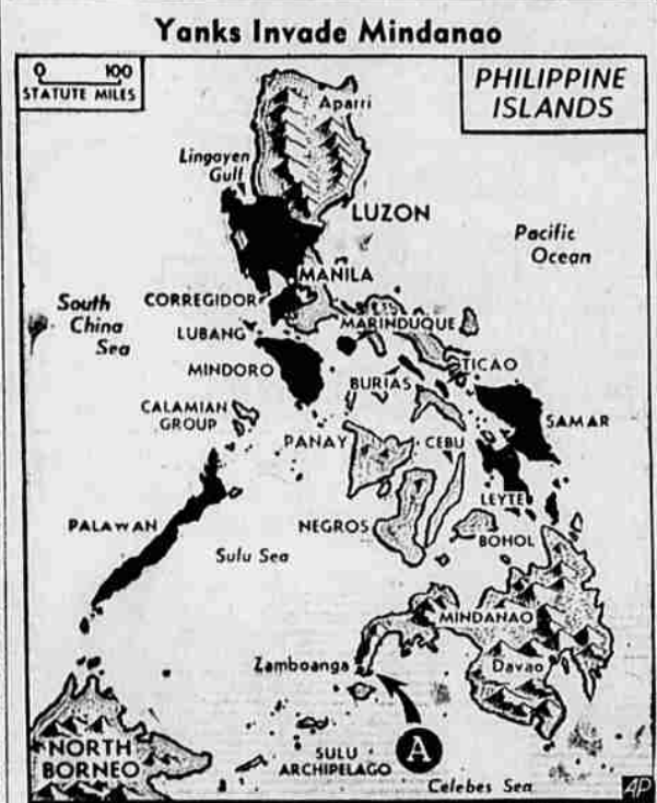
Infantrymen landed on Mindanao island Saturday, overrunning four villages near Zamboanga and capturing an airstrip. Japanese reports earlier had said that the invasion was made at Zamboanga, indicated by arrow. Black areas on the map indicate land liberated by the Americans.