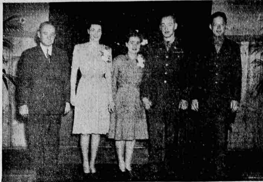
MARRY AT POST CHAPEL

Both This Agency and your Banker Know that you should have plenty of insurance to cover your risk fully. Ask him, then see us. Hans Norland Insurance Agency Fire, Auto, Casualty 118 N. 7th Ph. 6060