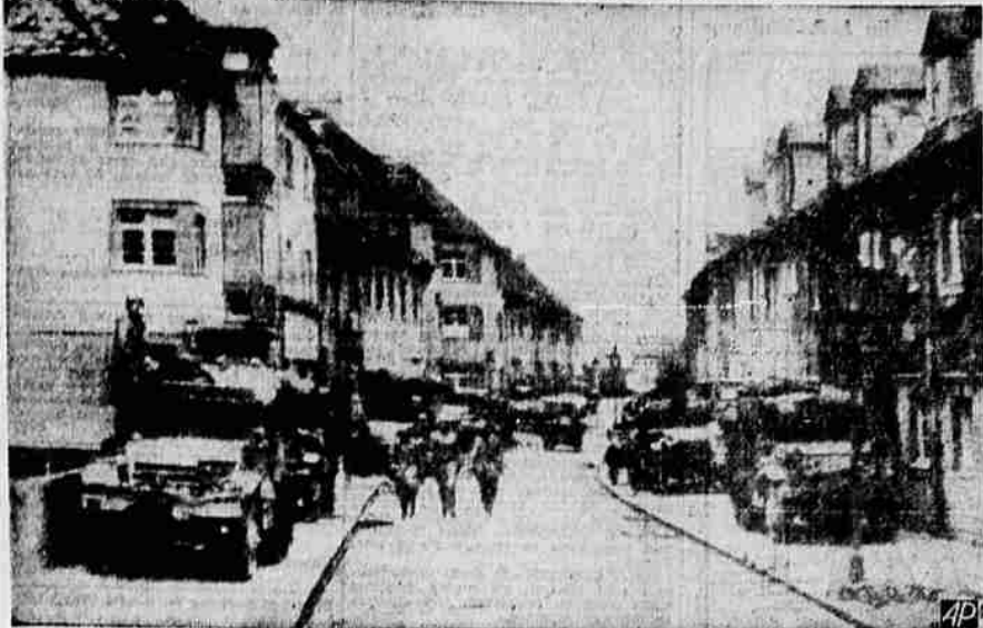
Troops and armor of the third armored division of the First U. S. Army wait in side street in the German city of Cologne before driving for the heart of the city whose capture was announced March 6. This is one of the first pictures taken inside Cologne and was made by William C. Allan, Associated Press photographer with the Warlimb Still Picture Pool. (AP Wire-photo via Signal Corps Radio).