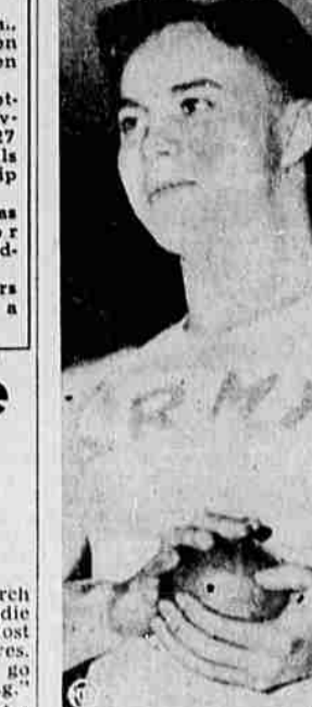
Because chow is good and seconds are seldom questioned at training table, Felix Bouchard is a shotputter. Army's line cracker of last fall placed second in National A. A. U. indoor championships at Madison Square Garden with 48 feet 7 1/2, and was favored to finish one-two in I. C. 4-A.