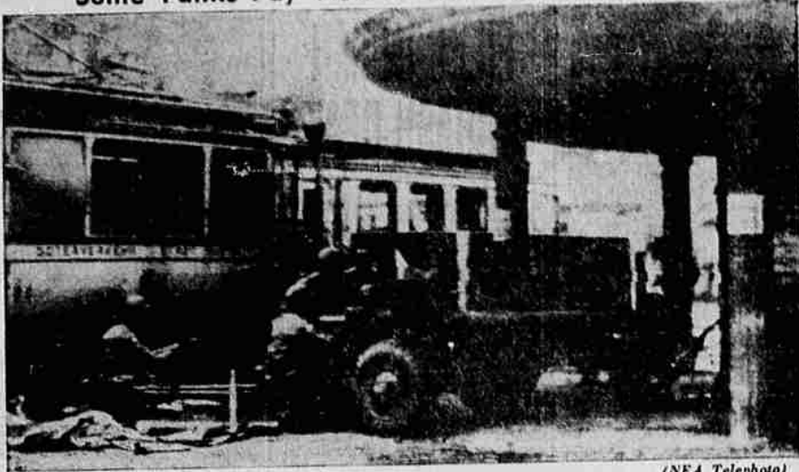
An American 57-mm. anti-tank gun uses the main trolley stop in Rhedyt, Germany, home town of Dr. Joseph Goebbels, Nazi propaganda minister, to cover advance of Yanks pushing through town.