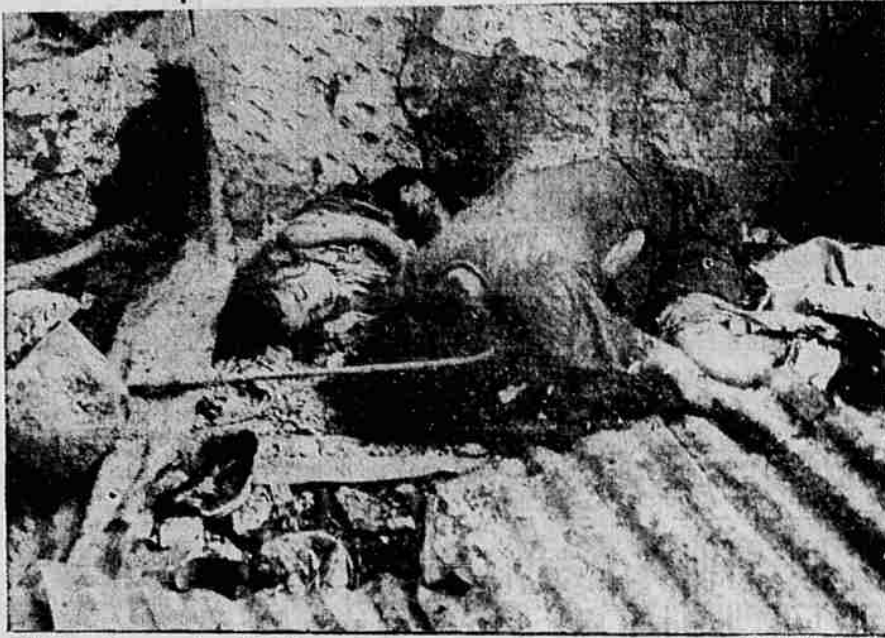
Shocking evidence of Jap atrocities, a Manila mother and child huddle in death inside walled city of Manila. During the many nights before American soldiers finally breached the walled section, U. S. observers nearby heard women's screams, then shots, then dead silence. Once inside they saw these and many other innocent victims of bestial Jap savagery.