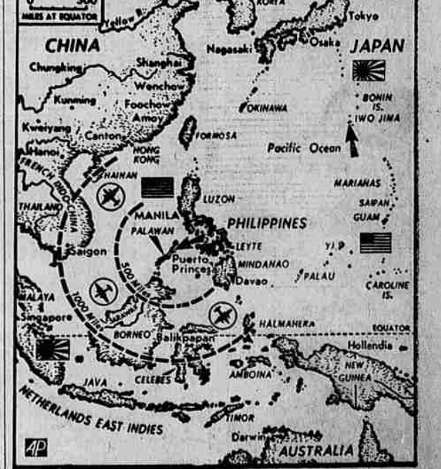
Distance arcs show relation of newly-captured Palawan island to the Asia mainland and the Japanese-held Netherlands East Indies. Far to the northeast U. S. marines were advancing against the Japanese on tiny Iwo Jima. (AP wirephoto map).