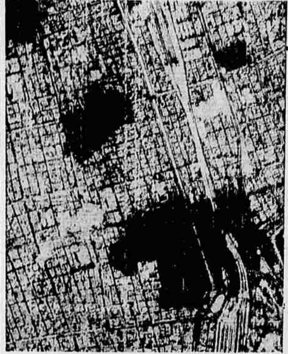
The dark sections in this airview of Tokyo are part of the 240 city blocks—20,074,000 square feet—that B-29 Super-Fortresses burned out in their heaviest raid of the war on the snow-covered enemy capital. Largest dark section is the big Ueno railway yard and freight marshaling station, apparently almost completely knocked out.