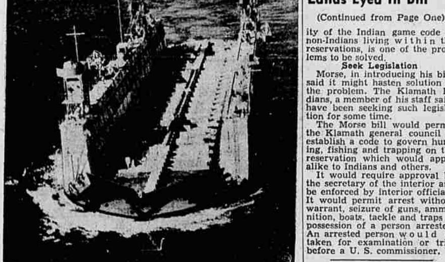
The Japs planned their war on the hitherto correct basis that a fleet could range only so far from its base before having to put back for supplies, fuel, ammunition and repairs. Uncle Sam crossed them up by creating a vast floating "base" which includes drydocks, floating cranes, "hotels," repair shops, bakeries, refrigerated warehouses and other units and employs over 12,000 men. This base extends a fleet's range by thousands of miles. Above is pictured one of the self-propelled floating drydocks which followed the fleet to Iwo Jima. Water is pumped into bulkhead compartments, sinking the dock floor below the surface. Ship needing service floats in, then compressed air empties the water tanks and dock rises, lifting ship high and dry.