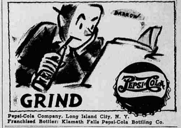
Pepsi-Cola Company, Long Island City, N. Y. Franchised Bottler: Klamath Falls Pepsi-Cola Bottling Co.