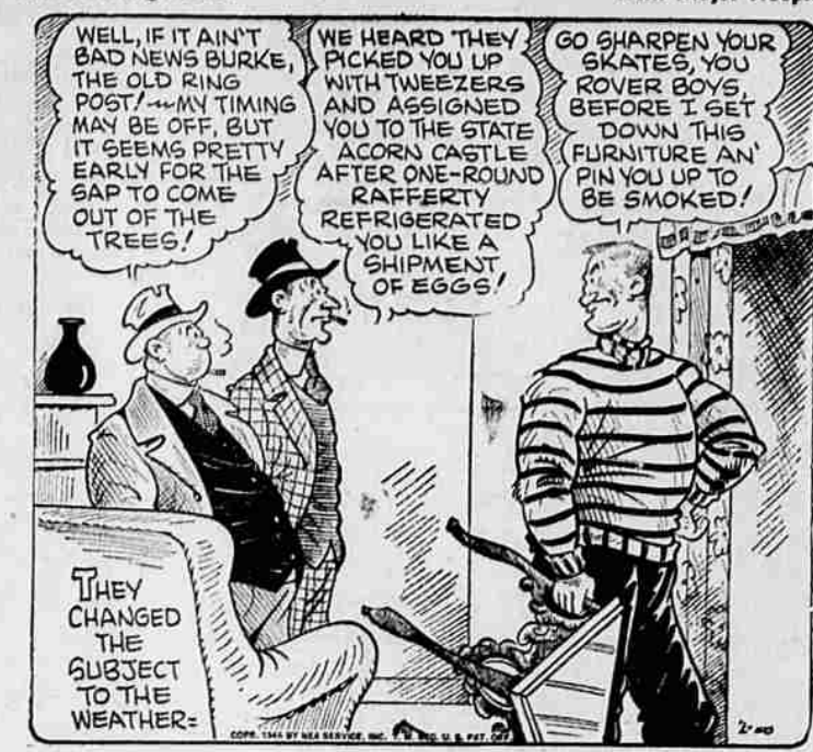
THEY CHANGED THE SUBJECT TO THE WEATHER