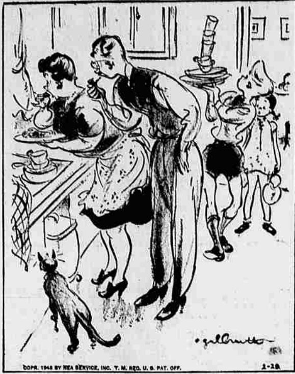
"Oh, I stick to my diet at the table, but I can't resist the little things the children leave on their plates, with food such a problem now!"