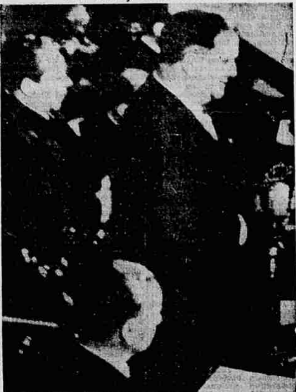
At Inter-American conference in Mexico City, Mexico's Secretary of Foreign Affairs, Ezequiel Padilla, stands behind President Manuel Avila Camacho, who delivered chief address at formal opening of the parley.