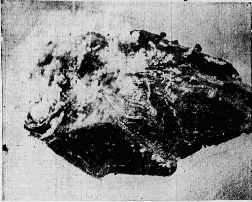
Corregidor Island, symbol of heretofore U. S. resistance before Philippines fell to Japanese, reefs with American bombs for the first time as 13th Army Air Force Liberators open the attack on the fortress guarding sea approach to Manila harbor.