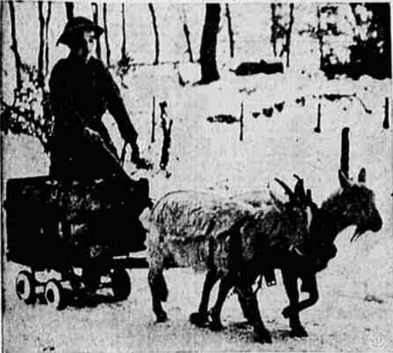
A pair of goats, found tied up and starving at a farmhouse by British troops on the Western Front, were rescued and fed and rewarded their saviors by going to work. Above, they pull a cart loaded with rations for the company cookhouse.