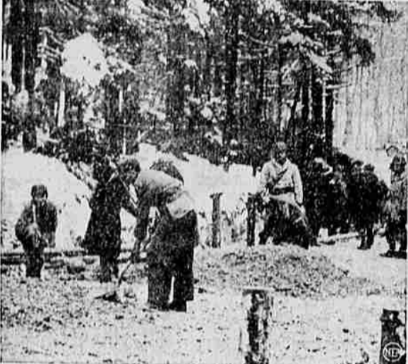
When the Yanks moved into the Rhineland, they immediately set to work rebuilding the war-torn countryside—and with civilian German labor. Eager and willing, the Germans, ranging in ages from 14 to 77, were put to work rebuilding roads, as shown above, operating sawmills and building fences. They receive about six cents an hour plus one meal of hot C rations and coffee.