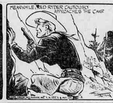
By Leslie Turner