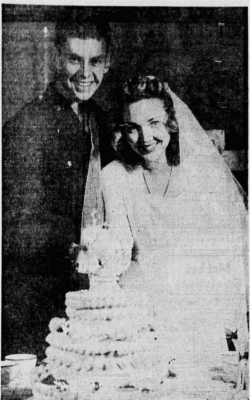
WED IN PORTLAND RITES