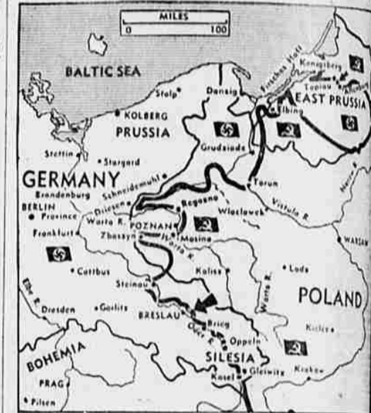
The German High Command acknowledged that the Red Army smashed into Brandenburg province, of which Berlin is the capital, that in another sector the Russians had hit the Odra River line at angles back within 78 miles of the capital. Moscow claimed the eastern front from the Carpathians to the Baltic had collapsed, and open the Reich to the Red Army.