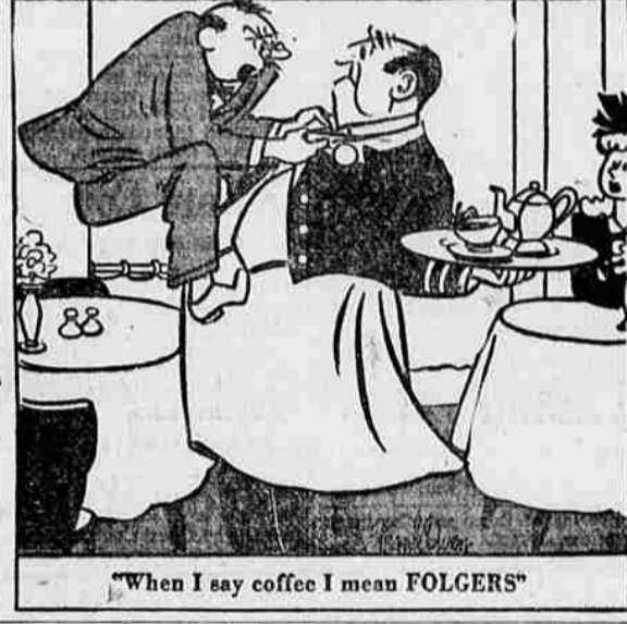
"When I say coffee I mean FOLGERS"

Sheepined Coats Water-Repellent. OREGON WOOLEN STORE Main and 8th