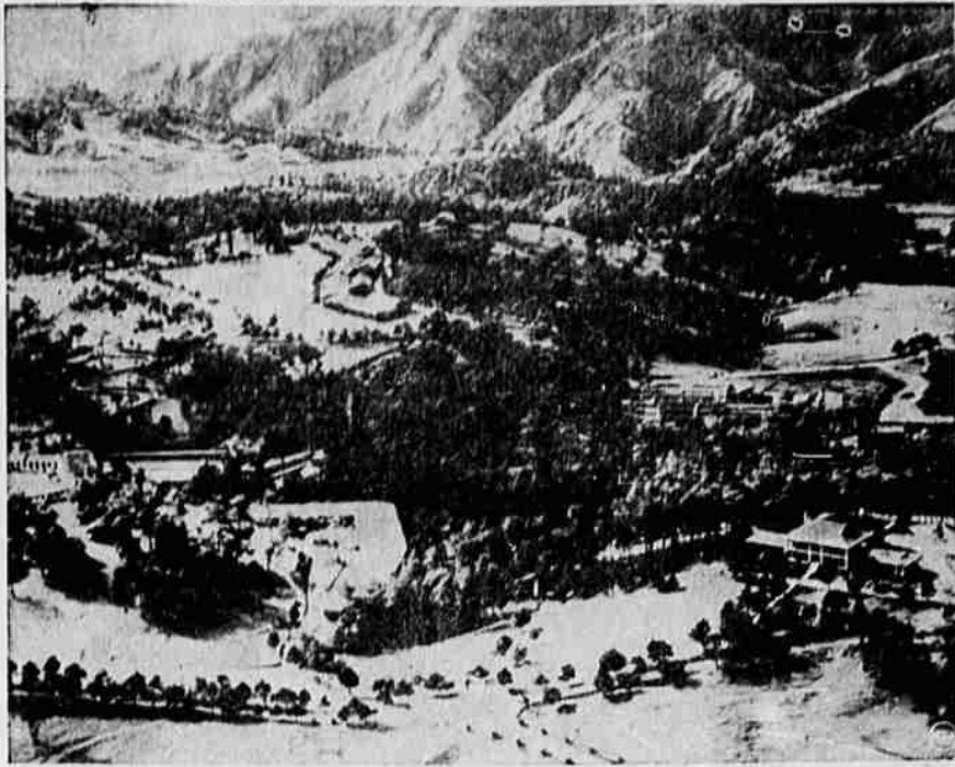
U. S. flyers have plastered with bombs the Luzon mountain resort town of Baguio, summer capital of the Philippines, and thought to be the seat of Japanese leaders on the island. In background of airview, above, of Baguio, taken before the war, can be seen the former U. S. Army post, Camp Hay.