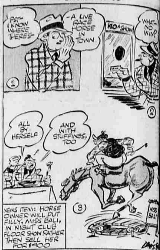
NEWS ITEM: HORSE OWNER WILL PUT FILLY, AMISS BALI, IN NIGHT CLUB FLOOR SHOW FATHER THEN SELL HER FOR $100