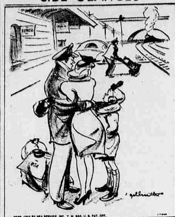
"Drop one on the Japs for me, Dad—they're the reason Mom won't buy me long pants, because she says it's patriotic to save cloth!"