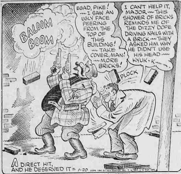
A DIRECT HIT, AND HE DESERVED IT— 1-20