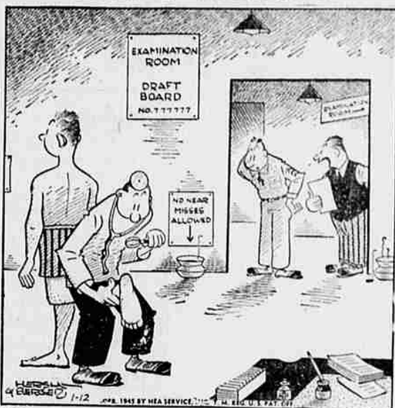
"Who assigned that veterinary to the examination room?"