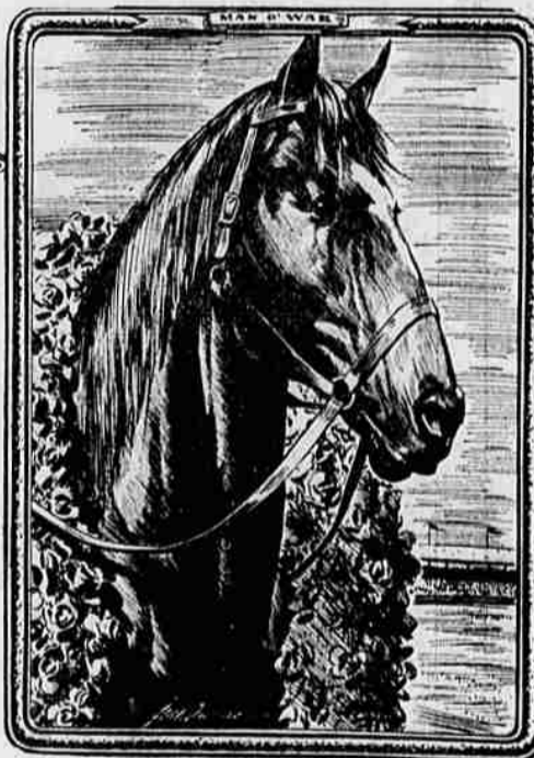
"MAN O' WAR"—during a two-year racing career, "Big Red" finished first in all but one of the twenty-one races he entered. Fame was his constant mate for many years after. Man O' War earned more than one million dollars for his owner, and lived to see the famous horse, Secretariat, the world's greatest money maker. Secretariat was his grandson.